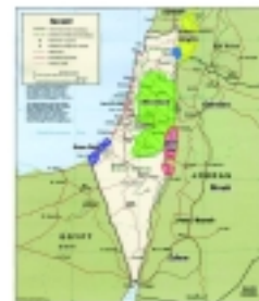
The disputed territories, Gaza, West Bank, Golan