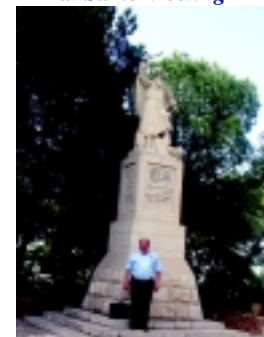
Prophet Hansen Elijah Statue at Mt. Carmel