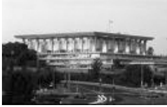
The Knesset-Israeli Parliament