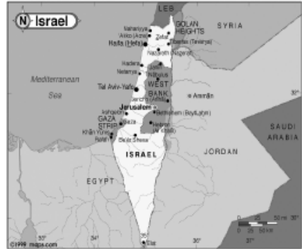
Occupied Territories in Israel Golan Heights, West Bank, Gaza

Please help me return to Israel as soon as possible with a television crew. I need your financial support to help me tell the real story of the land and people living in Israel and the Occupied Territories.