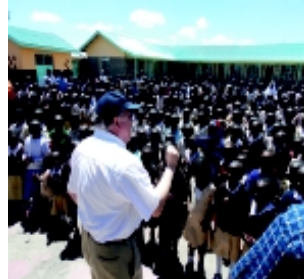
Thousands of people received the Word of God.