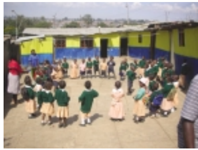
Victory Hope School in Kibera

Jesus Christ desires for us to be used as a conduit of His love. No matter how big or small the work is that He has called you to do, reach out and make a difference in the life that is in front of you. You don't need to be in a third world country to do that. God bless you.