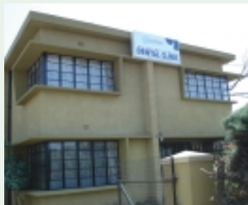
Nairobi Dental Care WMI South C mission house.