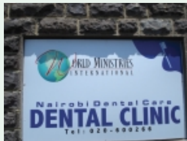
The new sign of World Ministries International at the Nairobi Dental Care clinic.