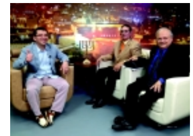
Oren Lev Ari CEO, TBN Israel Live on TBN Israel Set Jerusalem, Israel