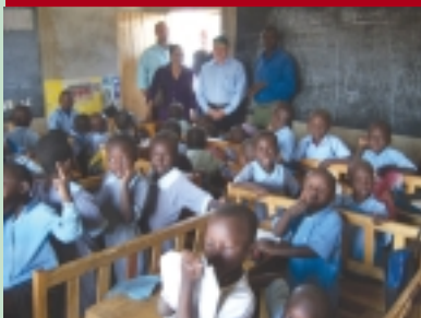
Another Mcedo classroom -Mathare slums-Nairobi