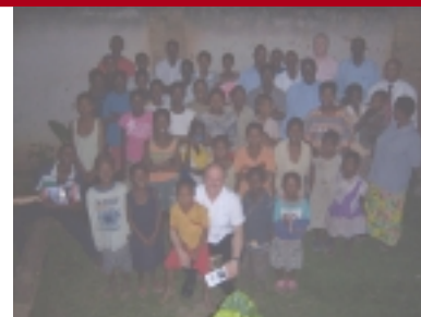
Orphans in Bujumbura, Burundi