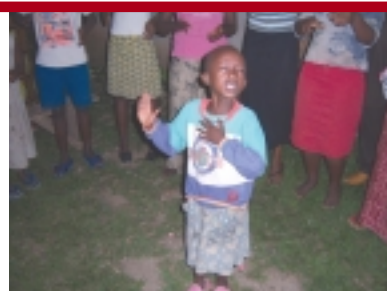
Little orphan girl singing to the Lord - Burundi