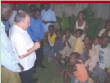
Praying with orphans in Burundi