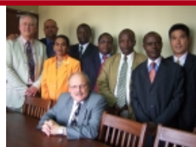
WMI team with Board of our Kenya Bible Schools