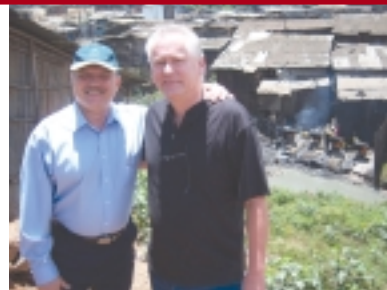
In the background men are brewing illegal alcohol