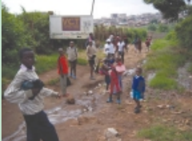
We built a 2nd dental clinic in Korogocho slums