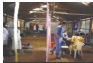
Two day Dental Outreach inside a church Eldoret, Kenya