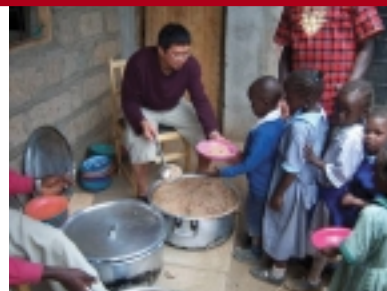
Feeding the Mcedo school children