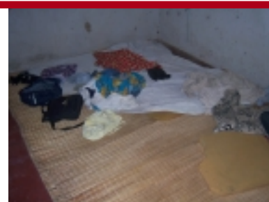
Orphans sleep directly on the floor