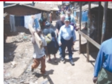
Walking in the Mathare slum with running sewage