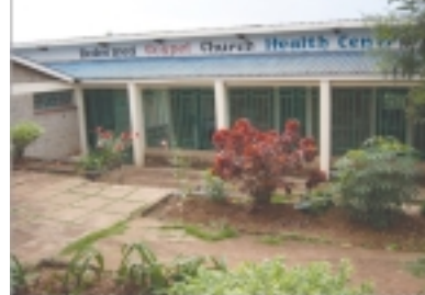
WMI Korogocho dental clinic in partnership with Redeemed Gospel Church Health Center