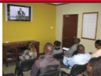
The WMI Bible School classroom- Nairobi