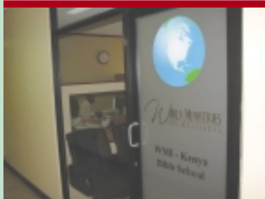
The WMI Bible School Office in Nairobi, Kenya